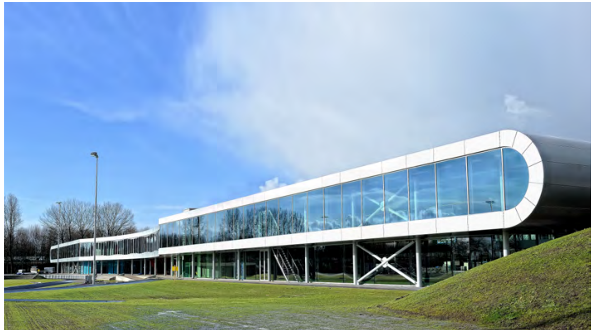
Ronald McDonald Center Only Friends Amsterdam, The Netherlands Project year: 2010

What was the conclusion of all that? Like every birthday child you are proud of, there was a great cake – the Sika Sarnafil® T cake. Looking forward to many more roofing projects to come! <