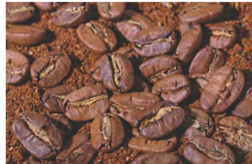
Through the production of coffee and cocoa, the country was an economic powerhouse in West Africa during the 1960s and 1970s.