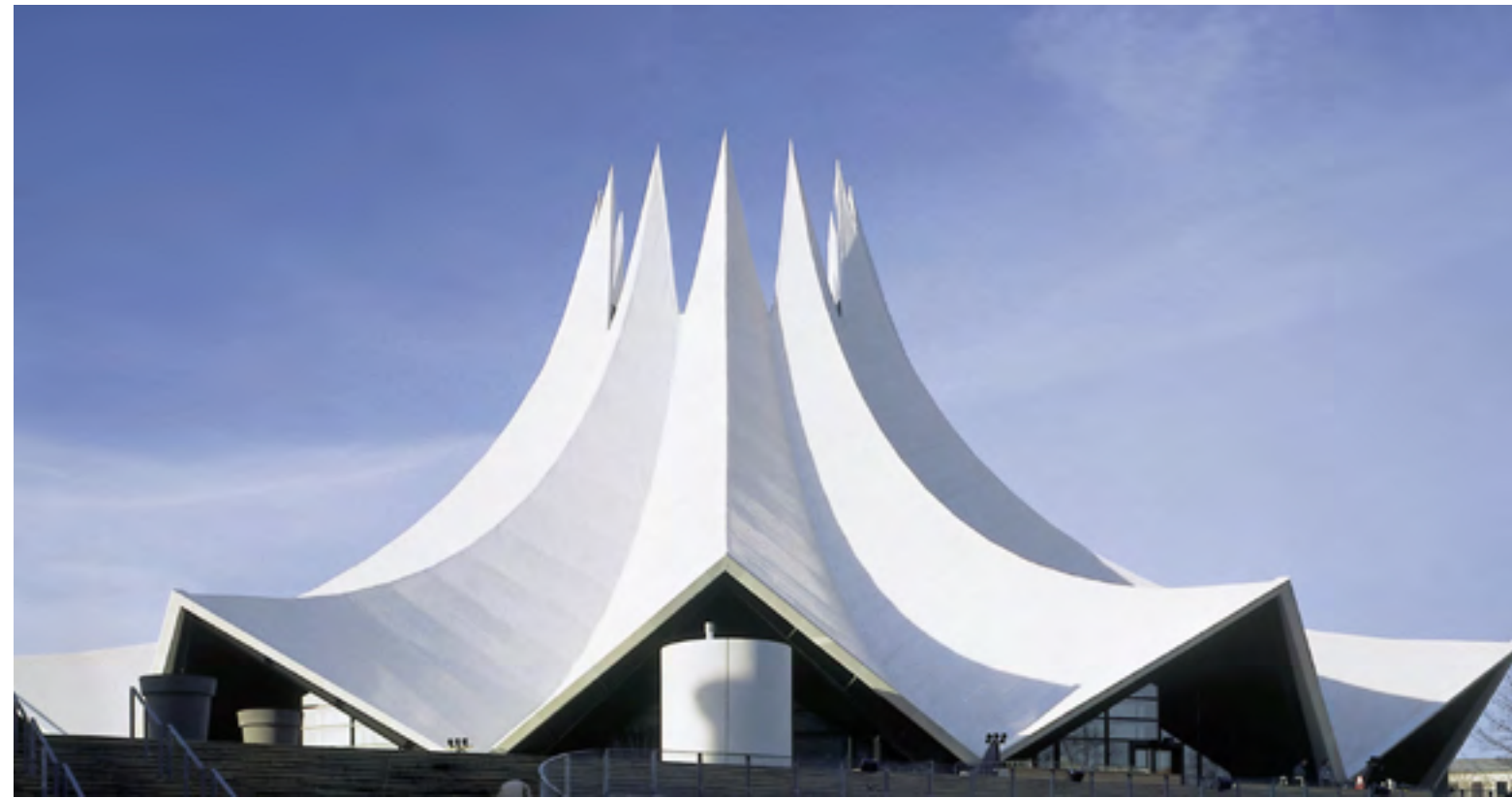
Tempodrome, Cologne, Germany Project year: 2001