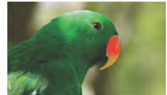
Located in the tropical zones of the continent, there are a wide spread of flora and fauna.

people, and for those who enjoy the sunshine, we have nine months of summer and no winter.