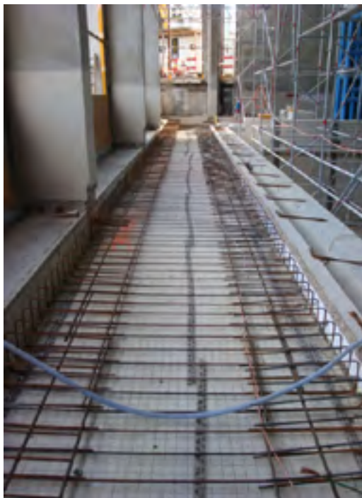
During works of refurbishment.

Now the inhabitants of Winterthur have something to look forward to again: even when it's raining and cool outside, which may well be the case for two thirds of the year, you can go swimming indoors. If you can't swim, take a lesson. And if you are getting bored of swimming, visit the sauna, which goes up to 100°C. Then no one can complain about the cold Mid-European climate of Switzerland. <