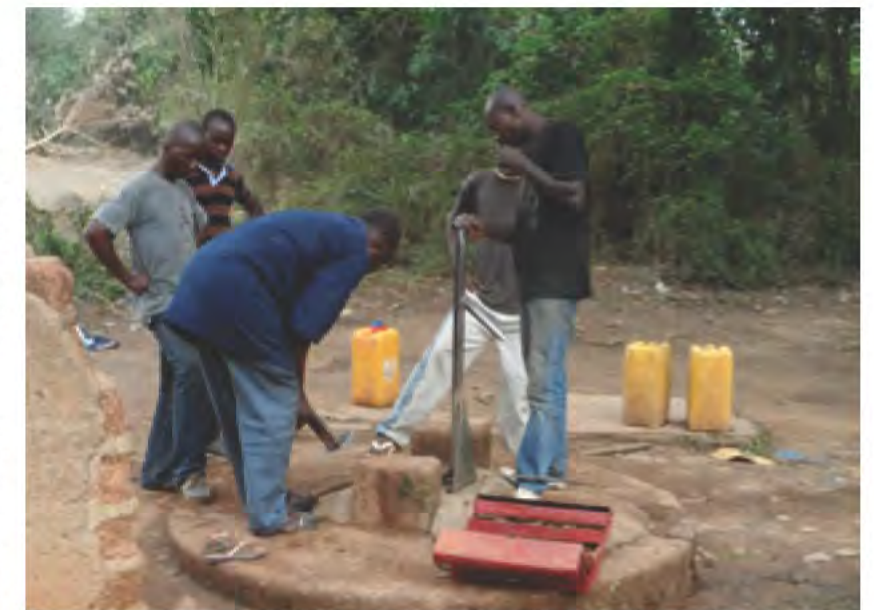
Access to clean and fresh groundwater has now been provided to the residents of 44 villages in total in Ivory Coast.

By the end of 2012, a total of 24 wells had been repaired and by the summer of 2013, another 20 wells had been put into operation. With 26 wells in a further 18 villages being fixed in 2014, access to clean and fresh groundwater has now been provided to the residents of 44 vil-