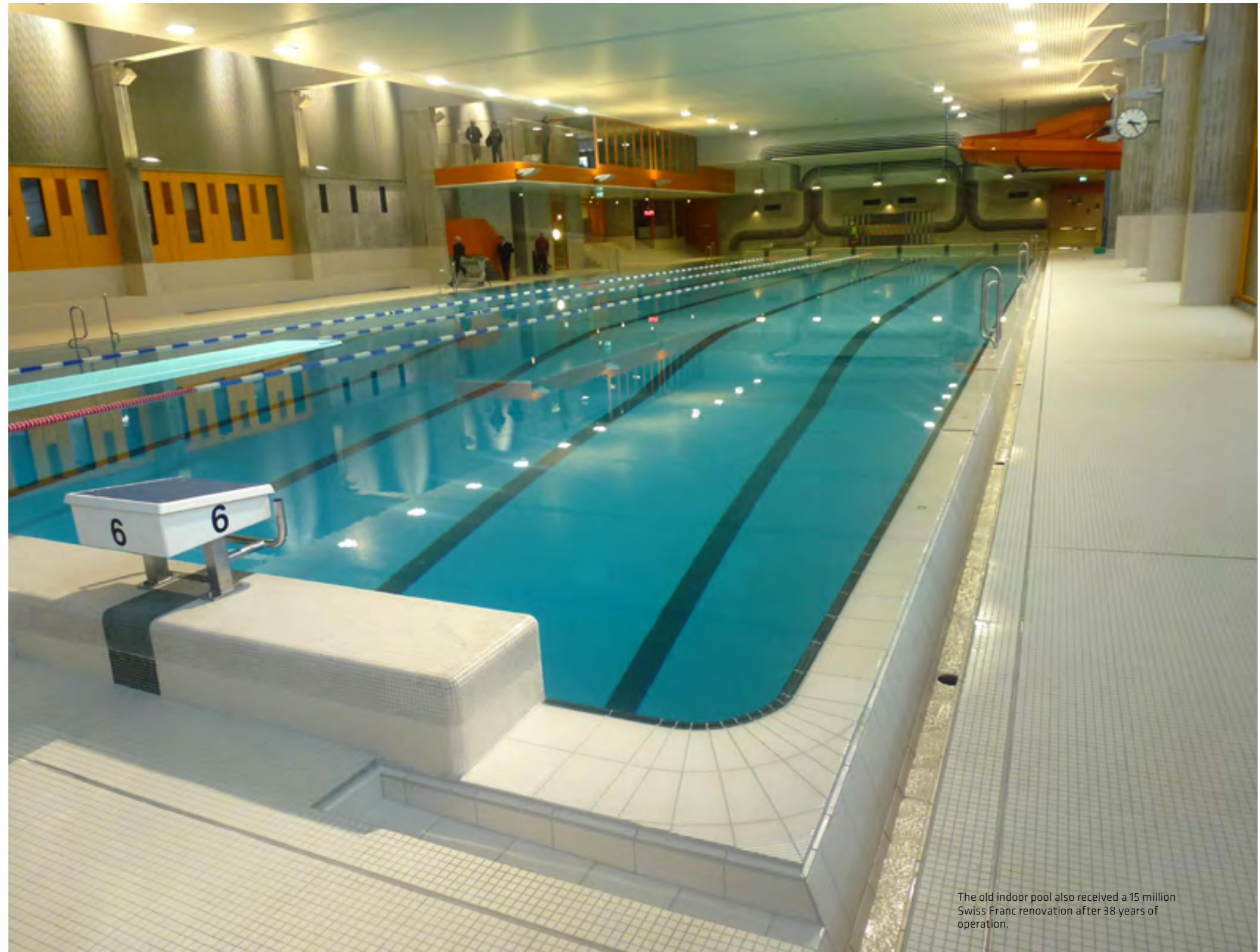
The old indoor pool also received a 15 million Swiss Franc renovation after 38 years of operation.