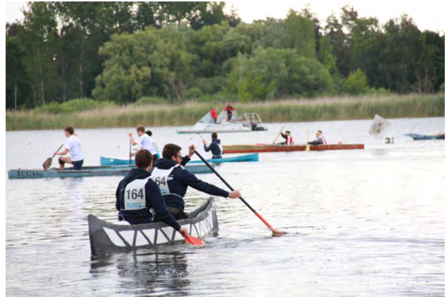
The shape of the canoe is traditional, an already existing 3D model that was downloaded from the internet. A 3D printer printed the plastic mesh mold for the boat.

The teams from ETH Zurich have won several prizes since the competition first took place. Two years ago, they received an award for their on-site canoe that was built the very morning before the race. This year, “Queen ElisamEshTH” won the