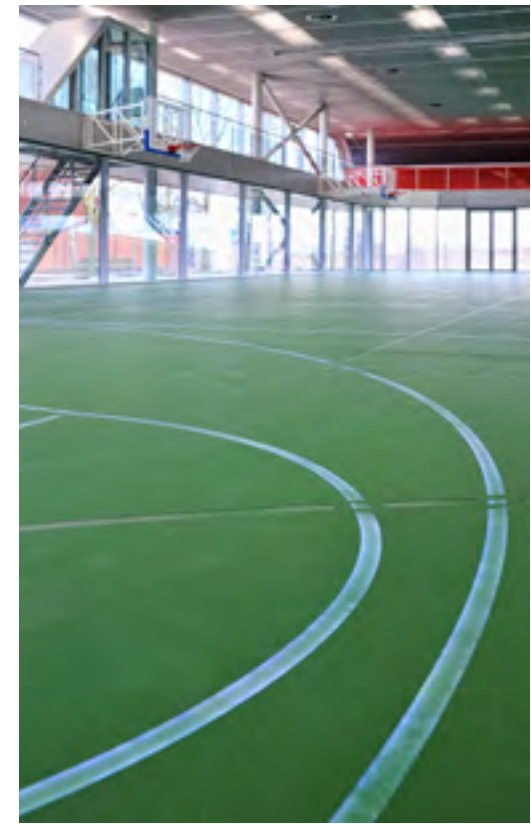
Inside of Ronald McDonald Center Only Friends Amsterdam, The Netherlands

> To help you make an informed decision, Sika describes commercial roofing systems to help you choose one that best fits your needs. One of the greatest challenges and needs is long-lasting and reliable durability when you build a roof. The Sarnafil® T roofing system has proven long-term stability in respect of membranes waterproofing mainly flat roofs. The first Sarnafil® T roofing system was installed in 1988 in Sarnen, Switzerland. According to a sample which was cut out from this roof in November 2013, today in 2015 that roof is still in absolutely perfect condition. But what does “absolutely perfect condition” mean?