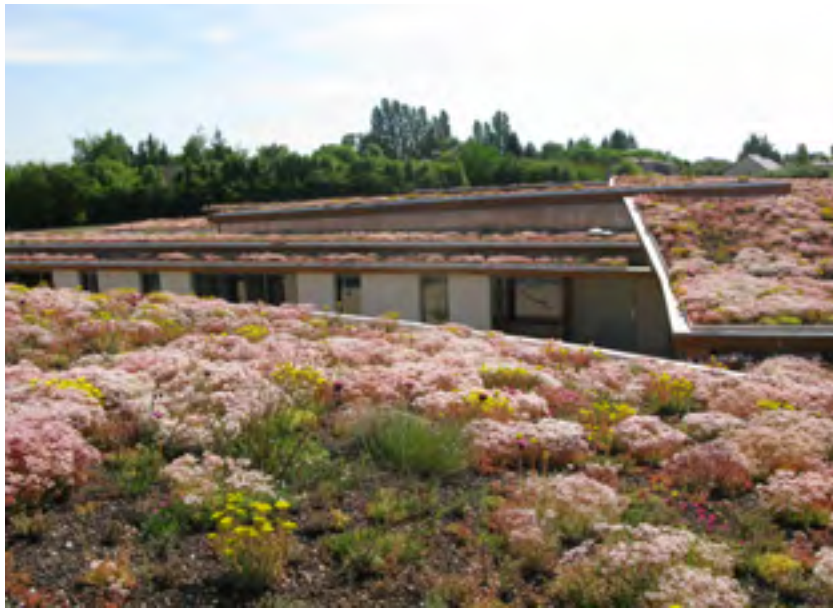
Saint Doulchard Medical Center, Cher, France Project year: 2010