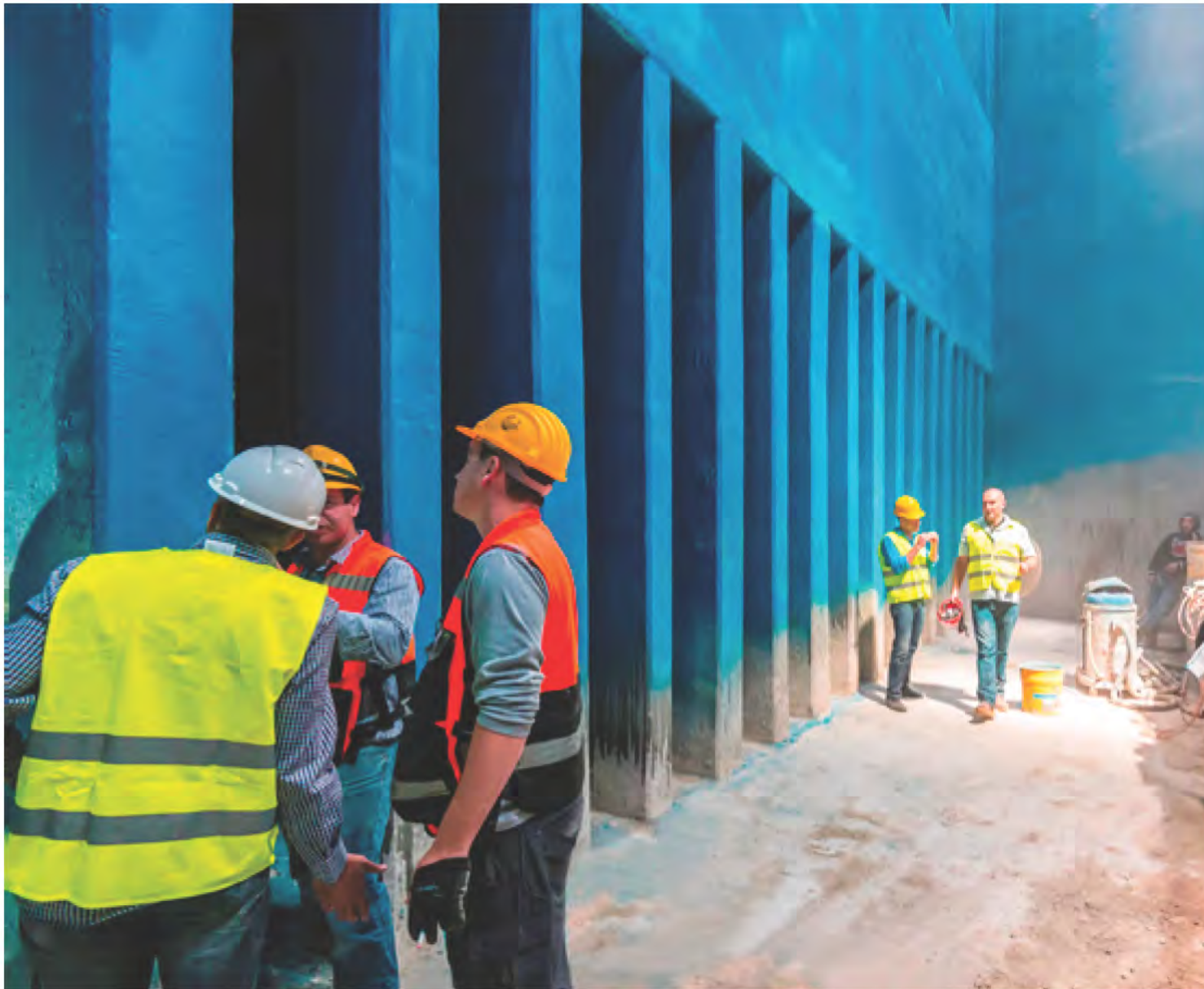
After the appropriate professional surface preparation by high-pressure water jetting, all surfaces are leveled with Sikagard®-720 EpoCem, followed by an epoxy primer, SikaFloor®-156. Every inch of the surfaces, covering 20,000 m 2 , spray Polyurea, Sikalastic®-841 ST.

> In 2002 there were about 12,500 desalination plants around the world in 120 countries. The most important users of desalinated water are still in the Middle East and North Africa. Among industrialized countries, the United States is one of the most important users of desalinated water, especially in California and parts of Florida. The cost of desalination has kept it from being used more often. Desalination is also used on many sea-going ships and submarines. One of the largest percentages of desalinated water used in any country is in Israel, which produces 40% of its water for domestic use from seawater desalination.