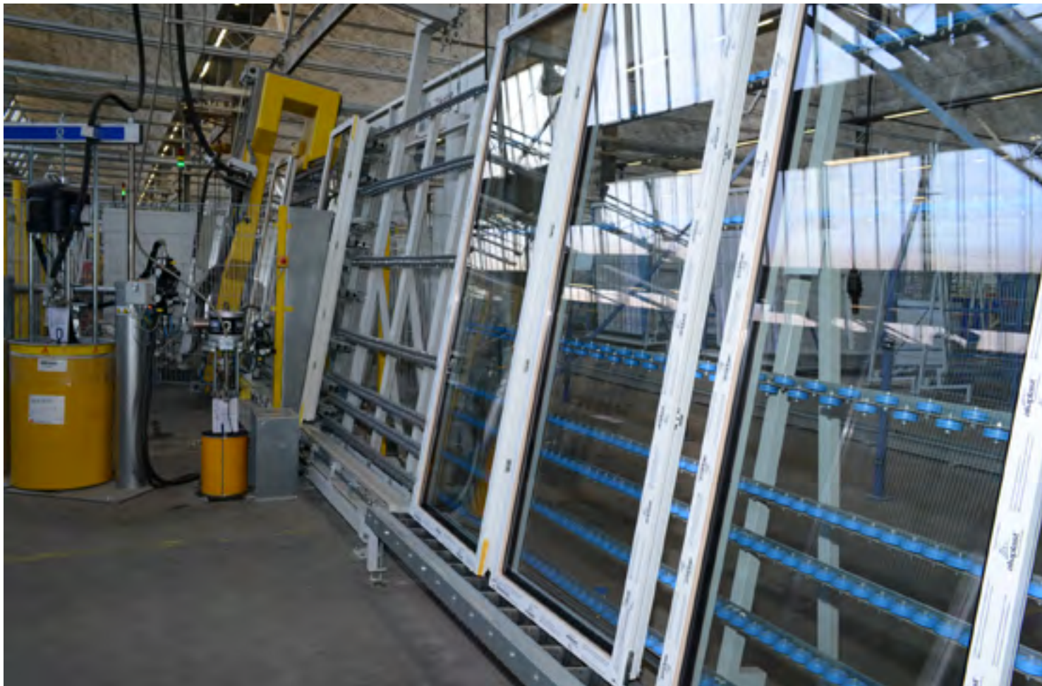
The consistently high quality of our products is largely due to the method of bonding the insulating glass in the sash frame – what we call the 'bonding inside' technology.